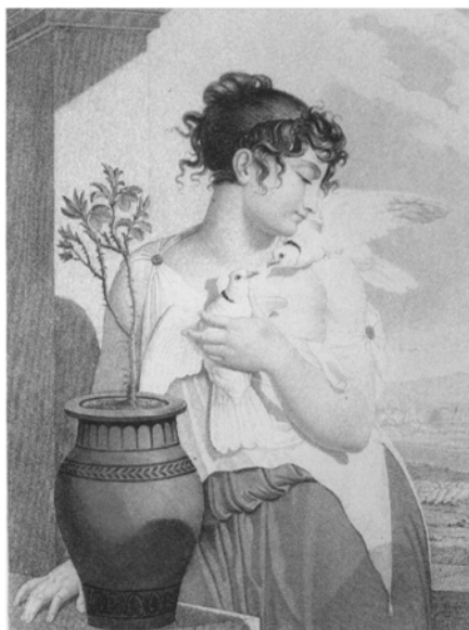
GERMINAL—Month of New Growth (March 21–April 19)

Source: Illustrations of newly named months, engravings made circa 1793.