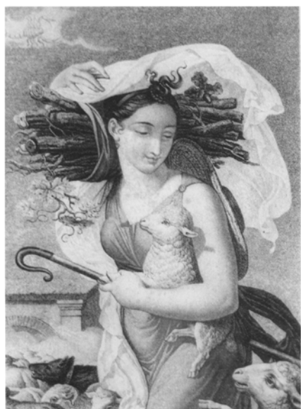
BRUMAIRE—Month of Fog (October 23–November 21)