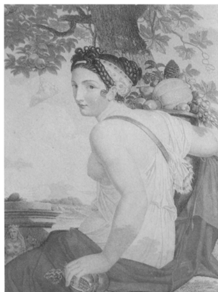
FRUCTIDOR—Month of Harvest (August 18–September 16)